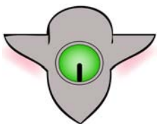
World's Oldest Traffic Light

SAS 22 NO FLOW MAY BE DIVERTED INTO THE NEW OR EXISTING SEWER UNTIL THEY HAVE BEEN INSPECTED, TESTED, AND APPROVED FOR USE. WRITTEN APPROVAL FOR SUCH USE SHALL BE OBTAINED FROM THE VILLAGE OF ASHVILLE.