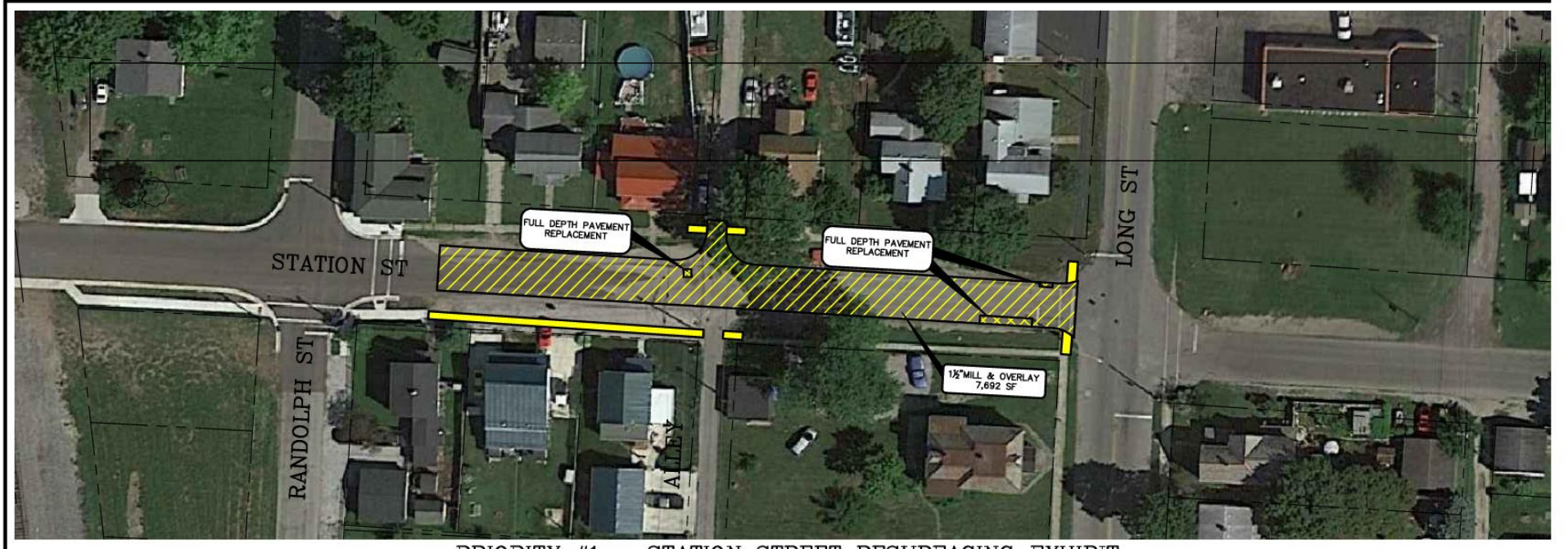
PRIORITY #1 - STATION STREET RESURFACING EXHIBIT