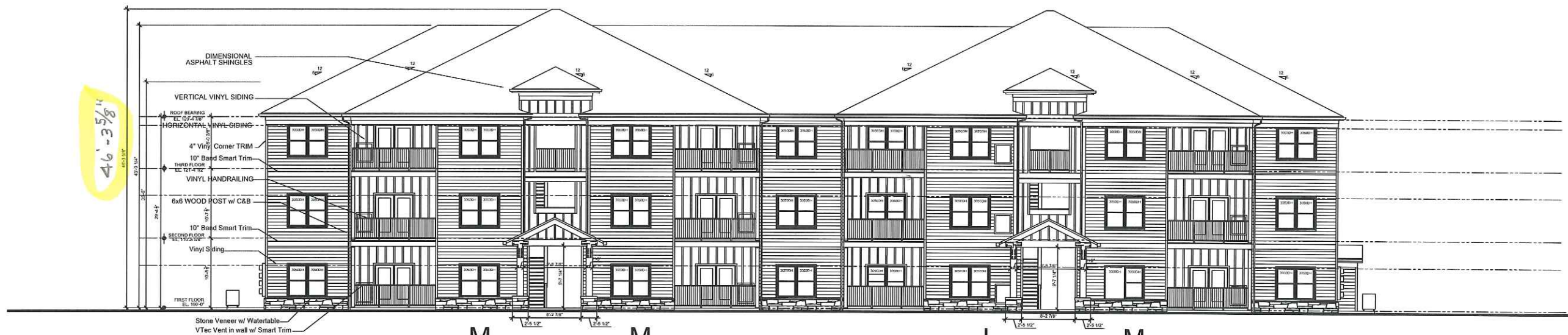
Building 24A North Elevation MJMM