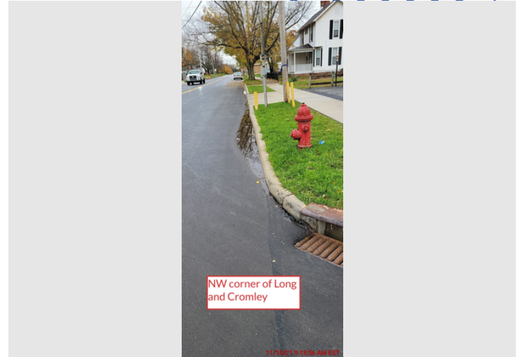
NW corner of Long and Cromley