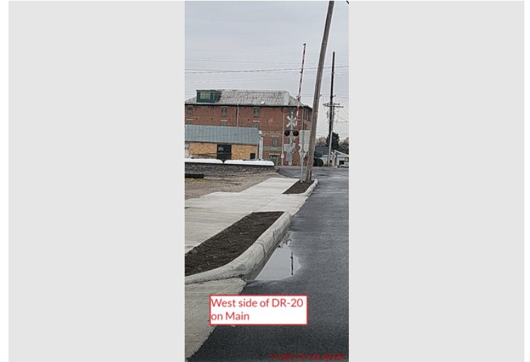
West side of DR-20 on Main