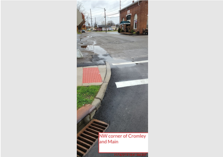
NW corner of Cromley and Main