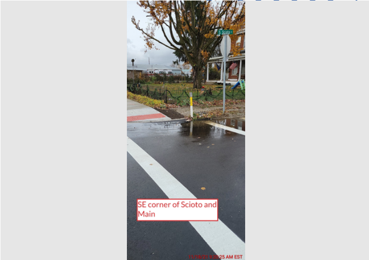
SE corner of Scioto and Main