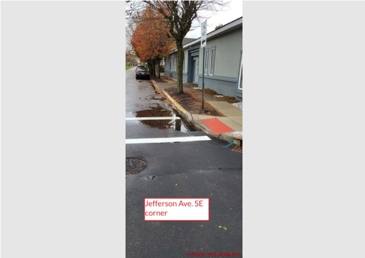
Jefferson Ave. SE corner