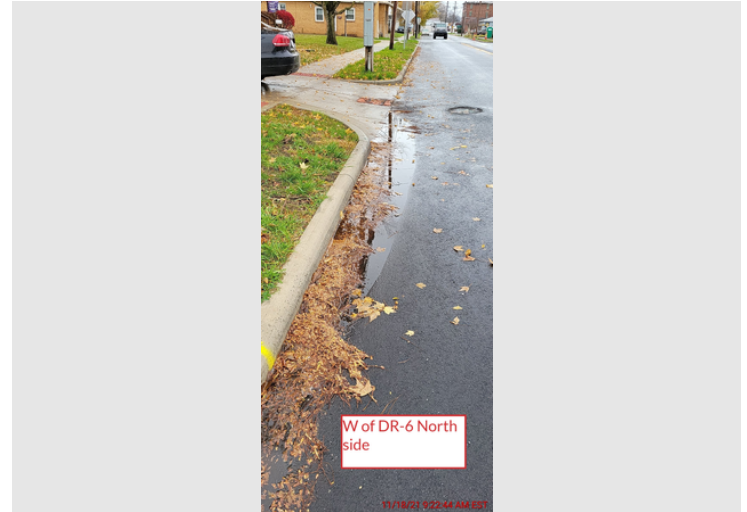
W of DR-6 North side