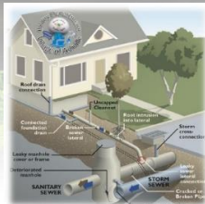
I & I