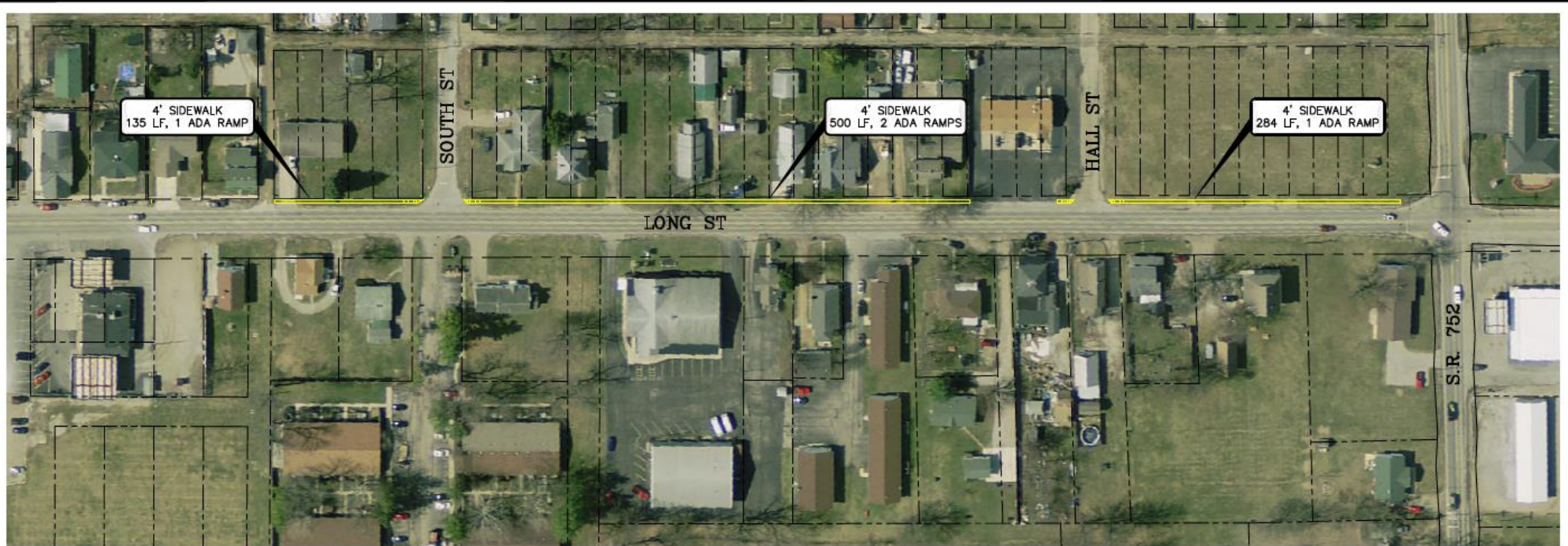
LONG STREET SIDEWALK EXHIBIT