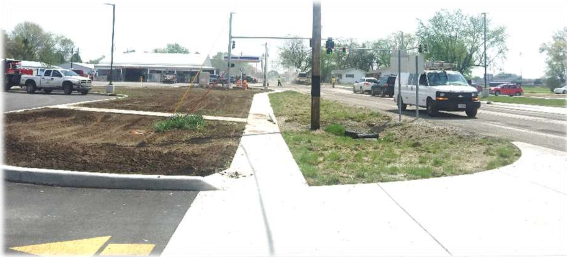
Sidewalk on Eastside of Savings Drive on St. Rt. 752