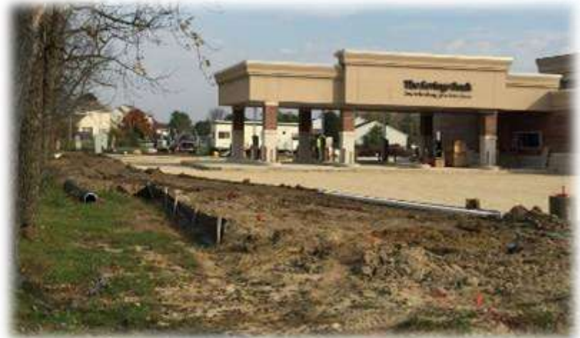
Northwest Corner View Lot – Savings Bank