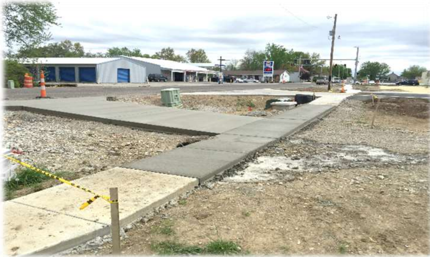
Utility Driveway North of Saving Bank