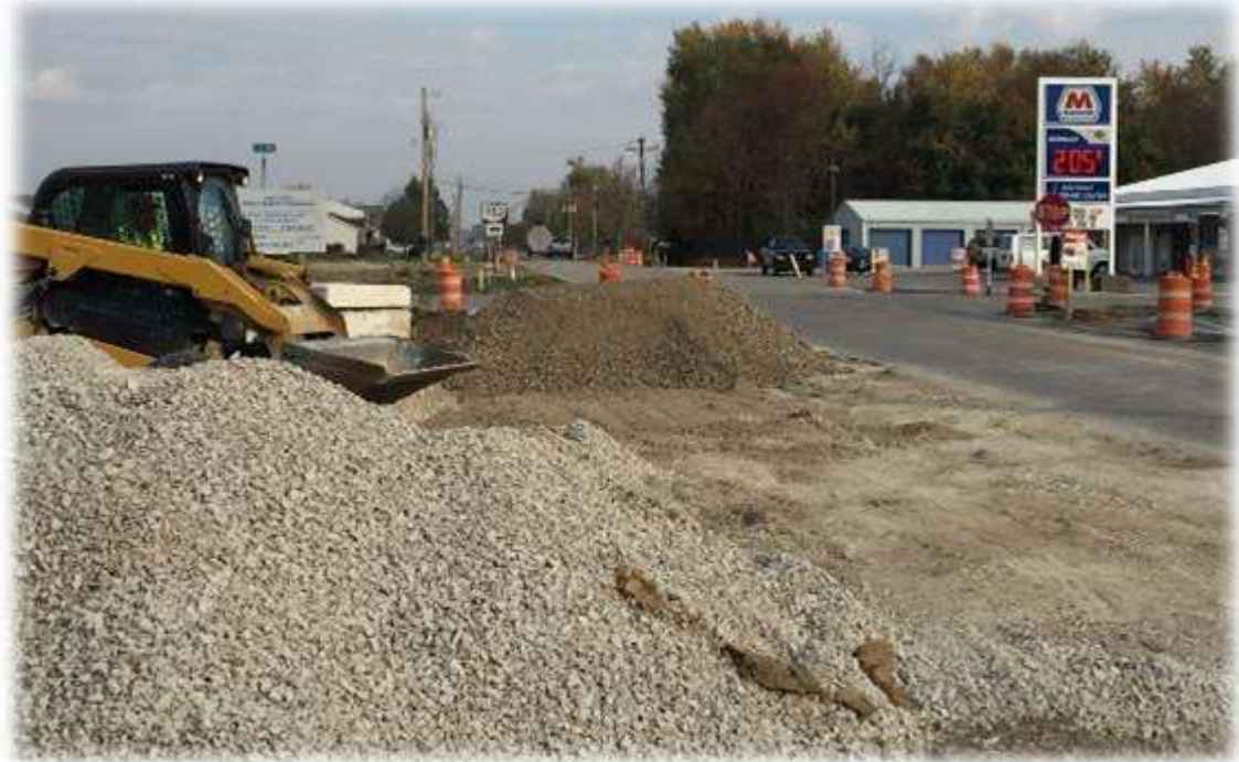
Southeast to Northeast View West of Long Street