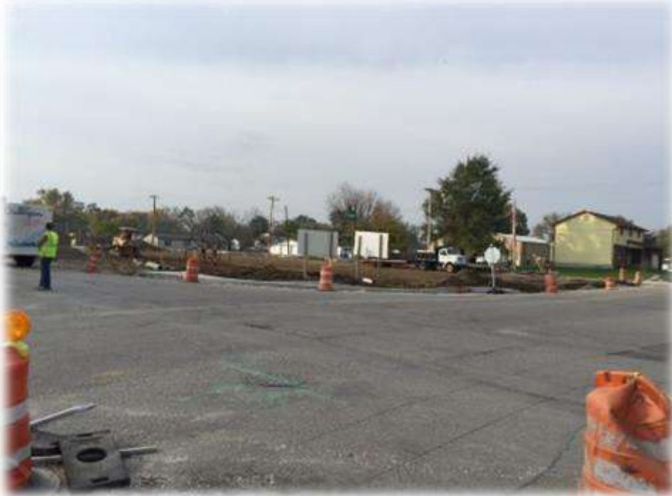
Northeast to Southwest View Corner