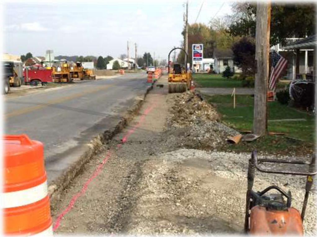
West to East View South of 752