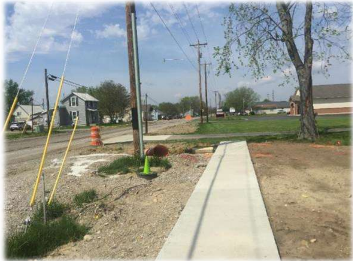
Sidewalk on Northside of St. Rt. 752