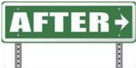
Photos from 2017 – State Route 752 east of Long Street