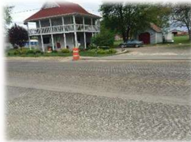
South Long Street looking from West to East