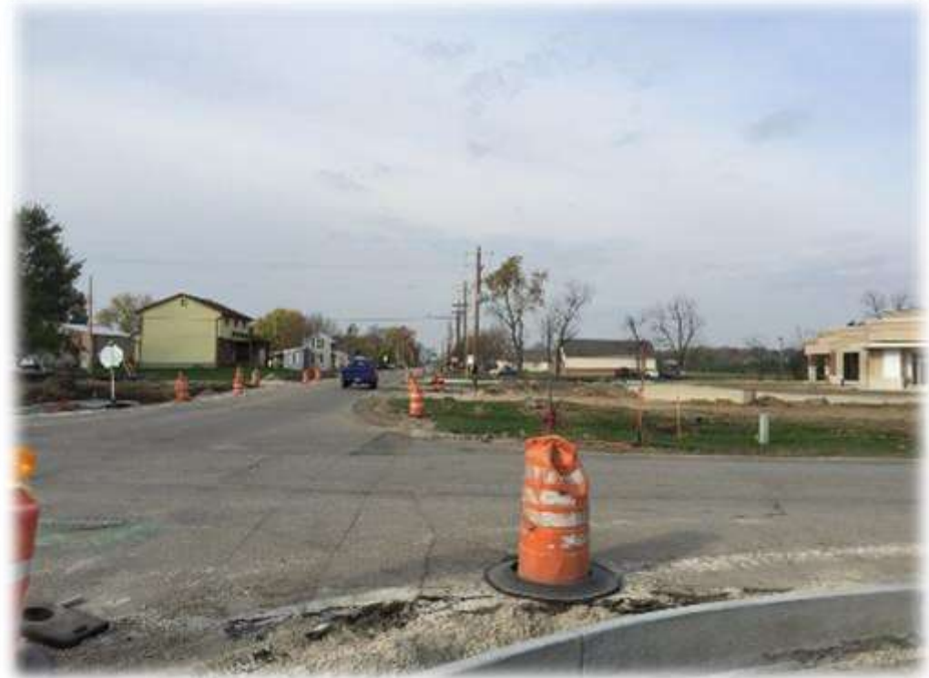
East to West View North of 752 Corner