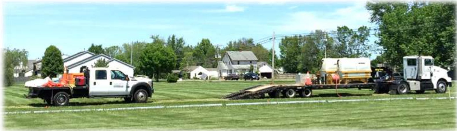
Conduit for cable