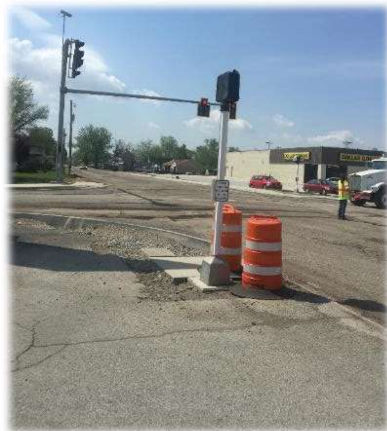
Northeast Corner looking Southwest toward Dollar General