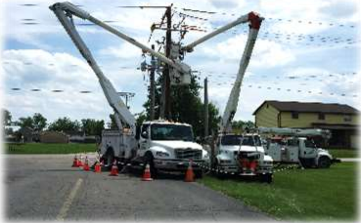
South Central Power installing new poles