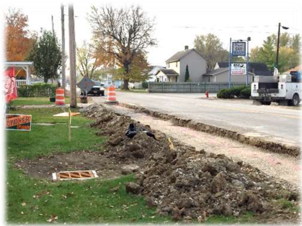
Storm Drain View South of 752 Eastside of Long Street