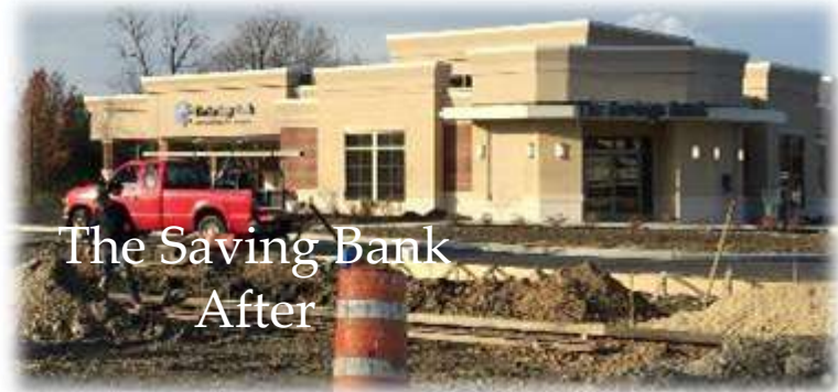
Economic Development The Saving Bank rebuilds a new bank on the north west corner.