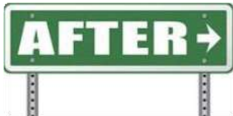
Photos from 2017 – Long Street north of State Route 752