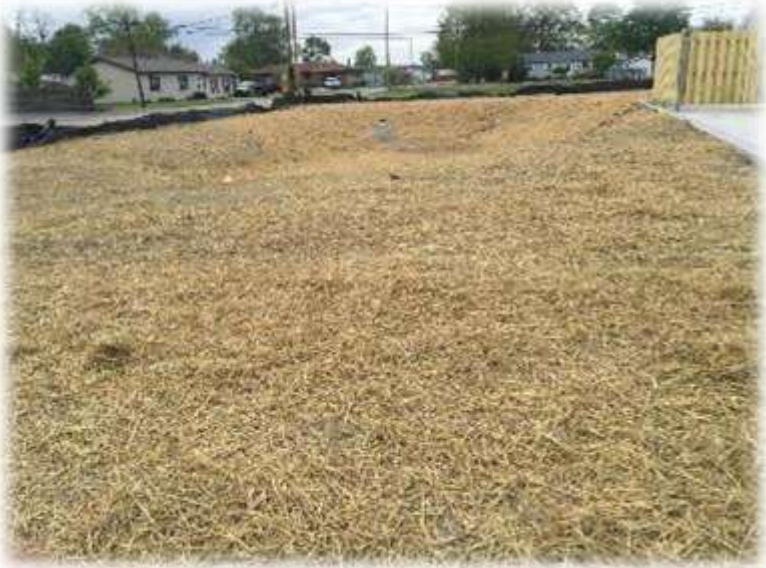
South of Dollar General