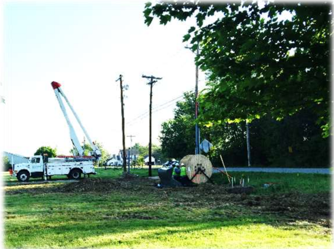
South Central Bucket Truck June 1 getting reading to move wire.