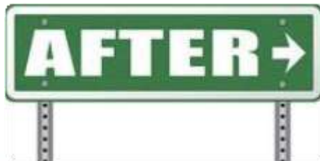
Photos from 2017 – Long Street South of State Route 752

CDBG Project on the south- side to connect sidewalks to the intersection at St. Rt. 752 & Long Street, see next slide.