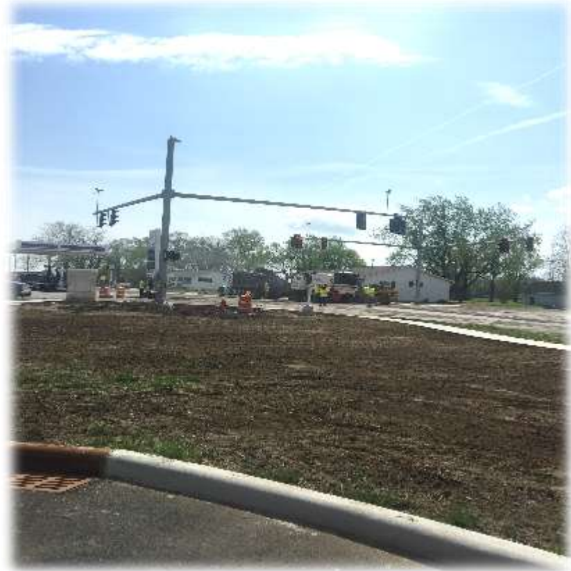
North West Corner of St. Rt. 752 & Long Street