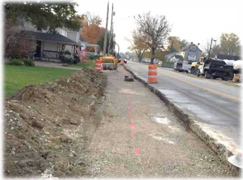
North to South View South of 752