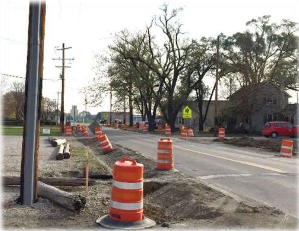
West to East View North of 752