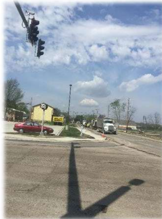
Southeast Corner of St. Rt. 752