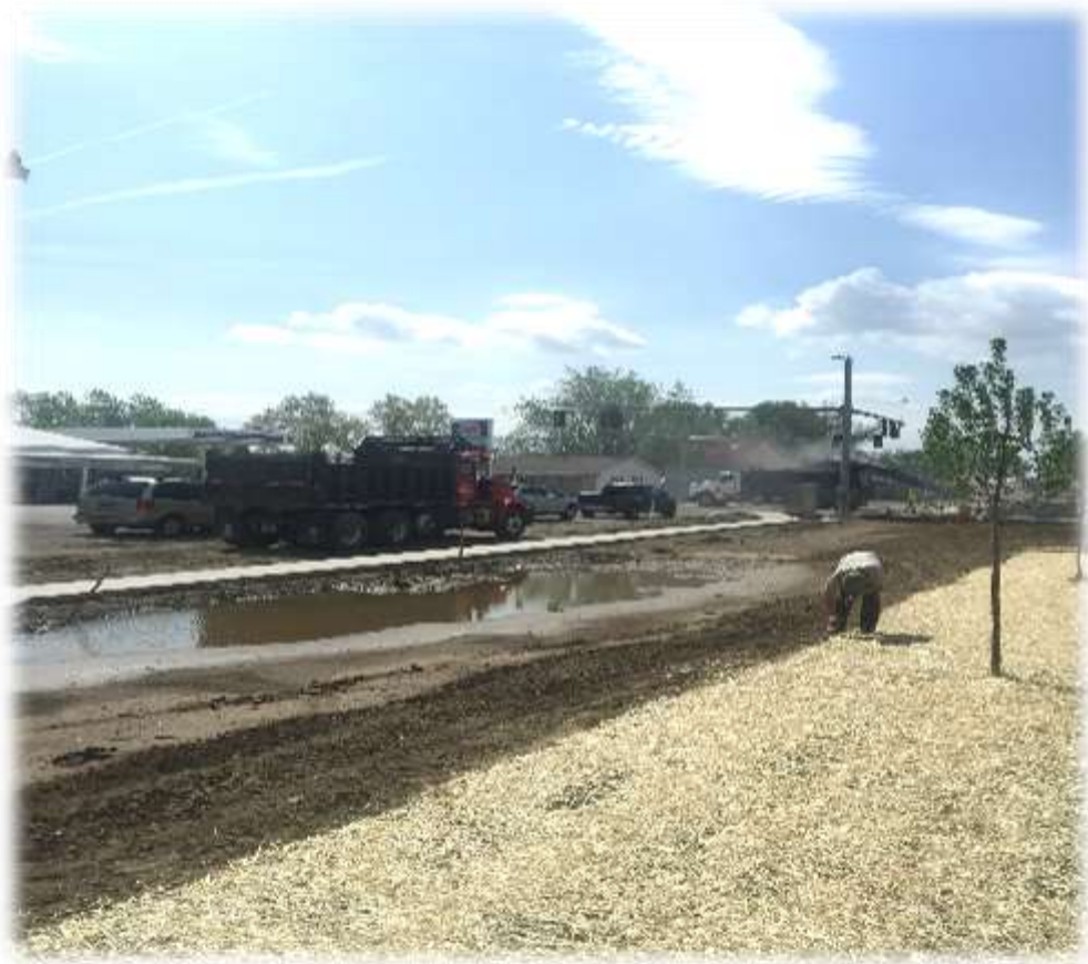
Westside of Long Street in from of Savings Bank