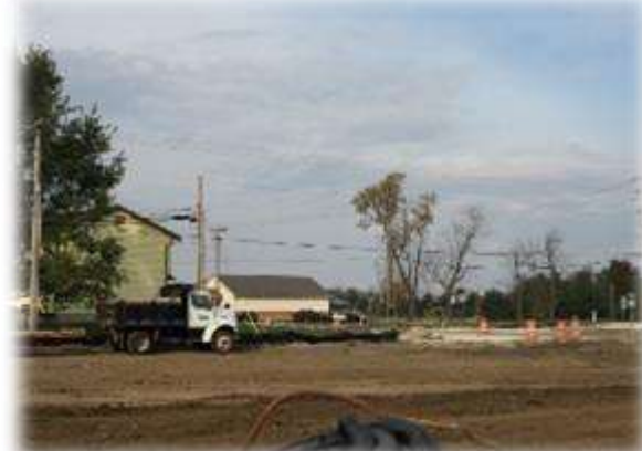
East to West South of 752 Corner Lot – Dollar General