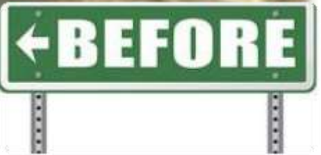
Photos from 2014 – State Route 752 east of Long Street