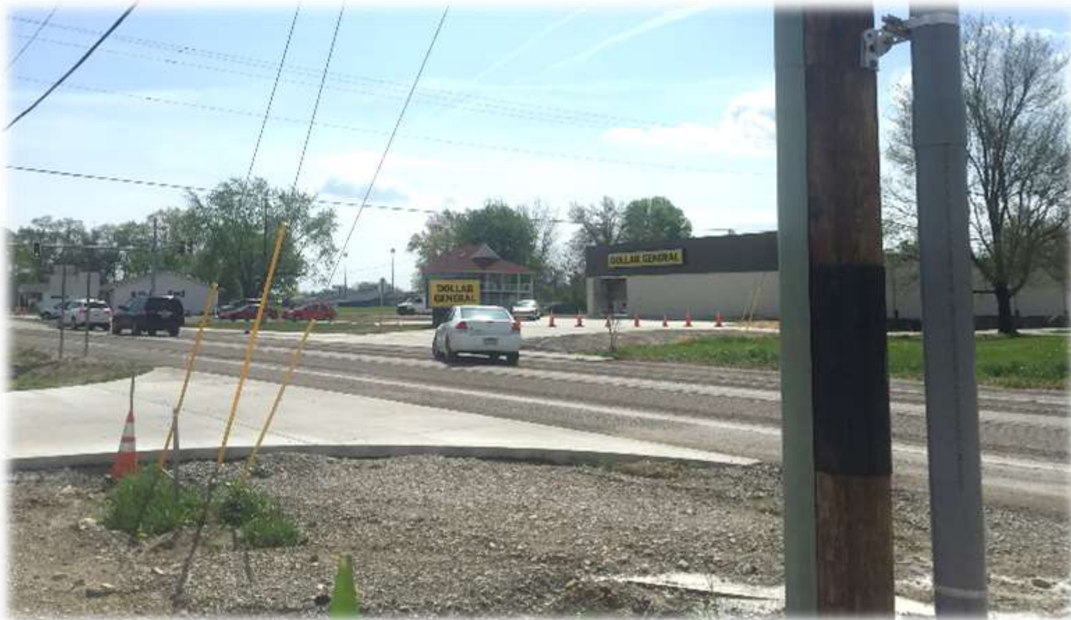
North to South View toward Dollar General