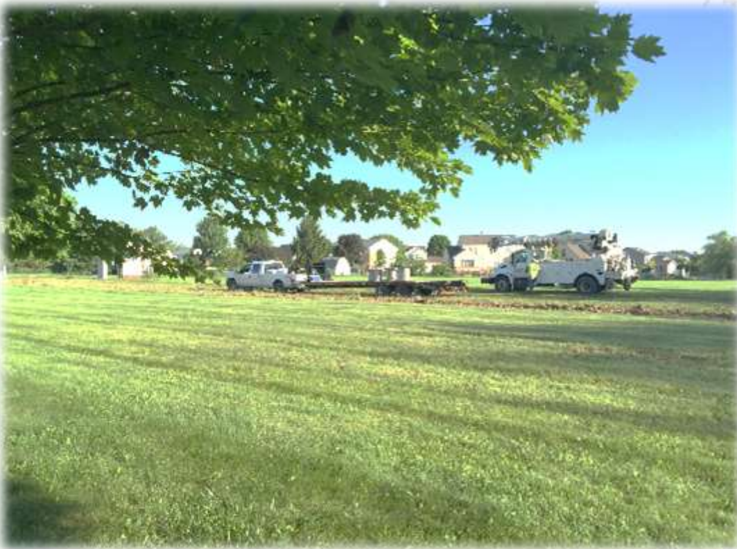
Wire and new pole installation