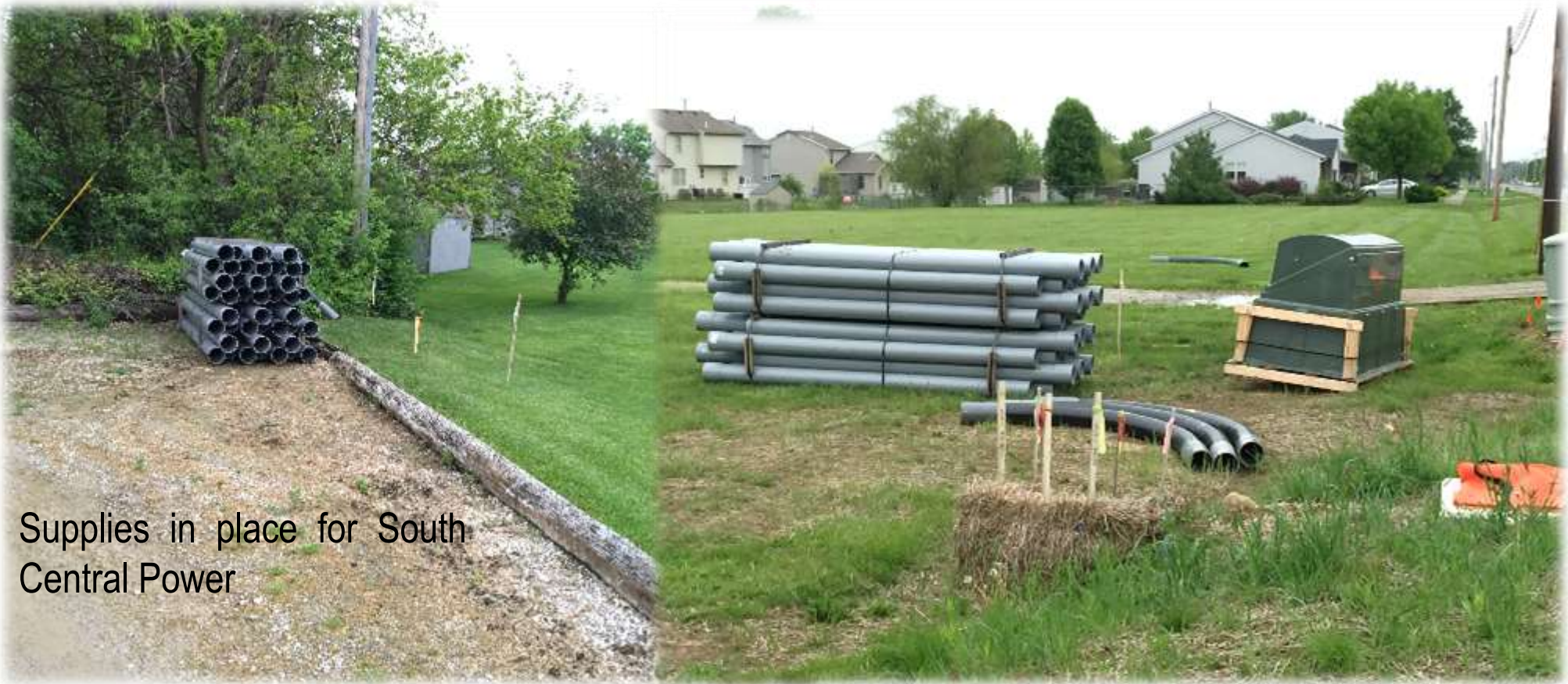
Supplies in place for South Central Power