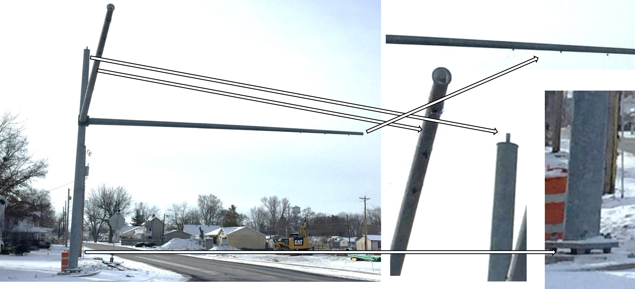
Photos from January 6, 2017 South East Corner Mast Arm.