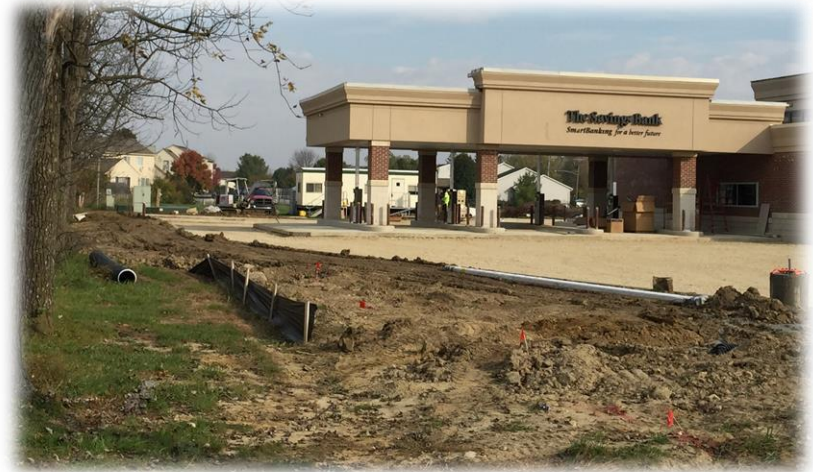
Photos from November 8, 2016 Northwest Corner View Lot