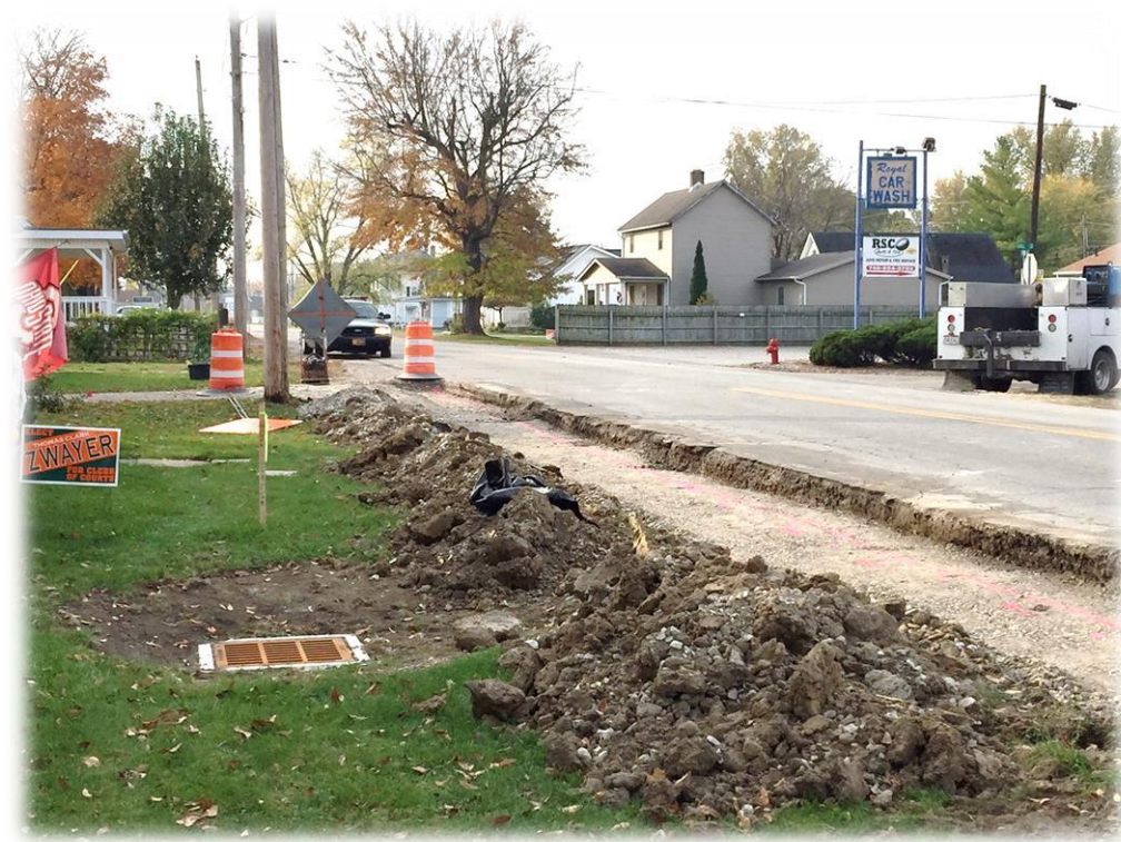
Photos from November 8, 2016 Storm Drain View South of 752 Eastside of Long Street