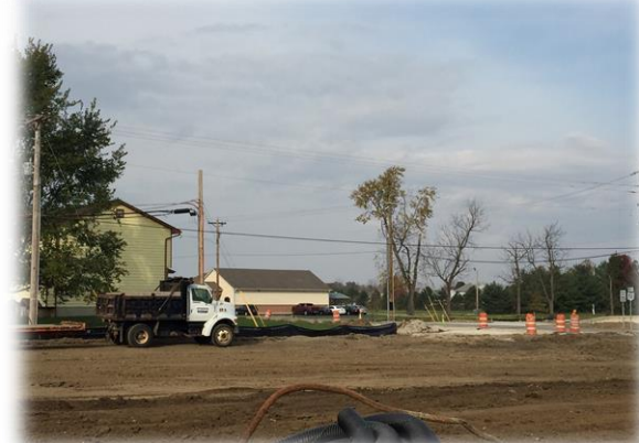
Photos from November 8, 2016 East to West South of 752 Corner Lot